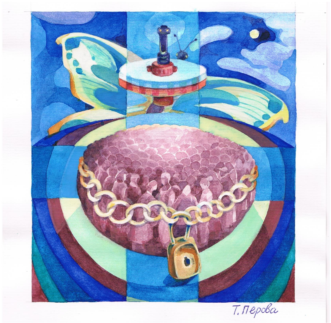
Figure 1. "Shackled with one chain". The generator is off. The formation of accumulations of red blood cells, "chained by one chain", suppresses metabolism in tissues, causes oxygen deficiency and generates unbearable pain. The morbid condition is the "No One No Cable" red blood cells.