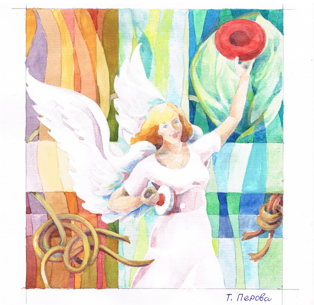
Figure 3. "Portal heart". Directing the light of the generator to the liver area starts the work, the so-called. "Portal heart", the second blood vessel, cleansing us of toxins. The liver, occupying a central place in the regulation of the blood flow of the abdominal organs, in addition to many functions essential for the whole body and cleansing us of toxins, performs one more: the vascular system of the liver is an additional pump (the main pump of the circulatory system - the heart), pumping blood from the main abdominal organs cavity into the common venous bed.

This is a 30-40% share of the total blood flow in the norm and 50-70% at increased loads. Such a "portal heart" (that is, associated with the portal vein, from the Latin portalis-gateway) greatly facilitates the liver to perform its multifaceted functions and restores the liver's function, undermined by the intake of numerous drugs, low-quality products and poor ecology.